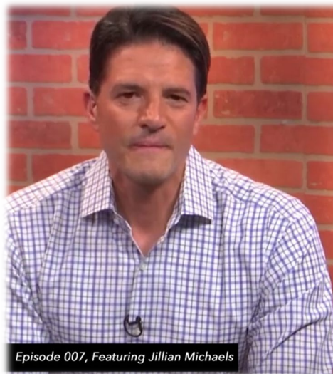
Episode 007, Featuring Jillian Michaels